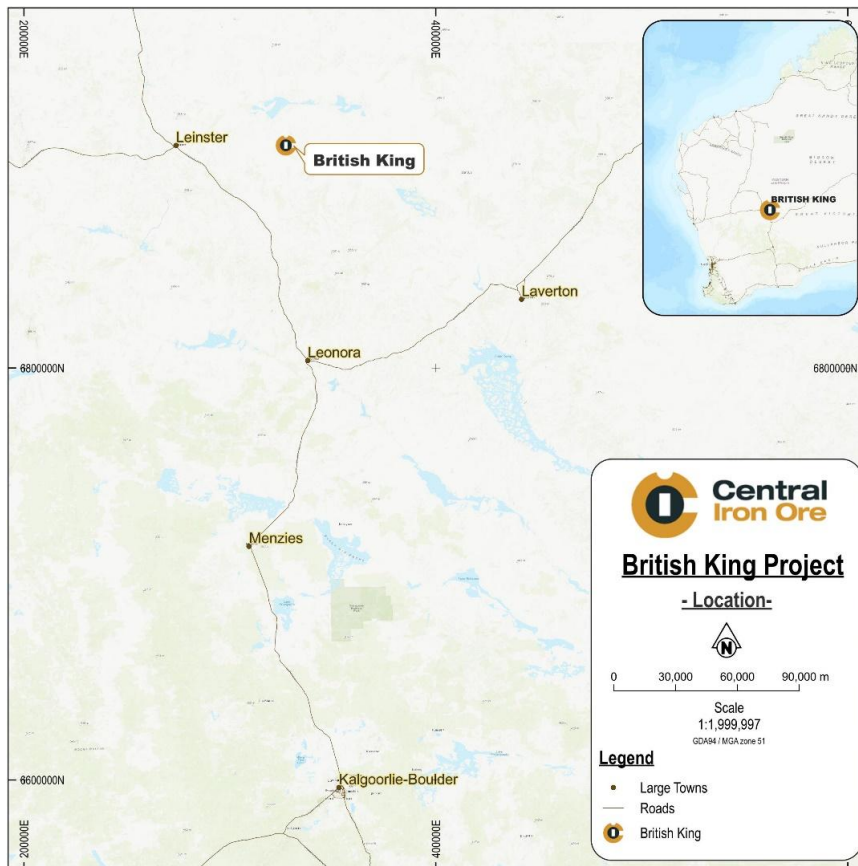
Figure 4. British King Project Location

The Company's British King Project is located across the British King Mine situated on the M37/30 Mining Tenement, approximately 320km northwest of Kalgoorlie and 60km east of Leinster in Western Australia (Figure 4).