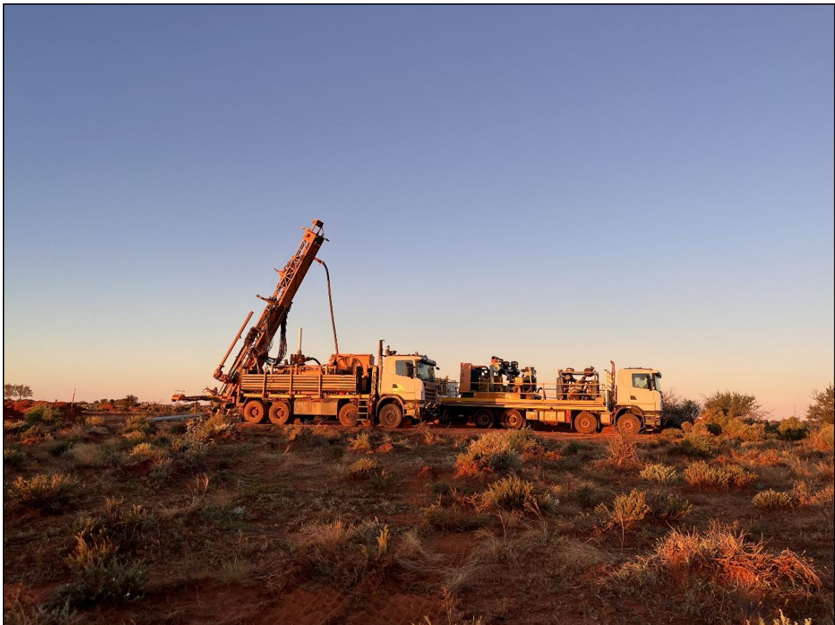
Figure 1. The sun sets after another successful day's drilling of the 2025 Phase 1 RC campaign at the British King Project

Central Iron Ore Limited is pleased to announce that the next phase of resource expansion drilling at the British King Project in Western Australia has commenced (Figure 1). 78 Reverse Circulation ('RC') drillholes are scheduled to be completed over a 9-week campaign.