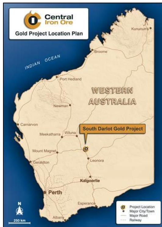
Figure 1: Locality map of the South Darlot project