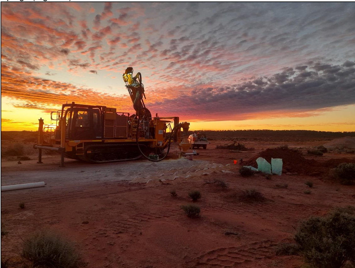
Figure 1. The sun sets after the first day's drilling of the 2024 RC campaign at British King (M37/30)

Central Iron Ore is pleased to announce that the next phase of exploration activities at the British King Project in Western Australia has started on the June 8, 2024, with 39 Reverse Circulation ('RC') and 4 diamond holes scheduled to be completed over a 7-week campaign (Figure 1).