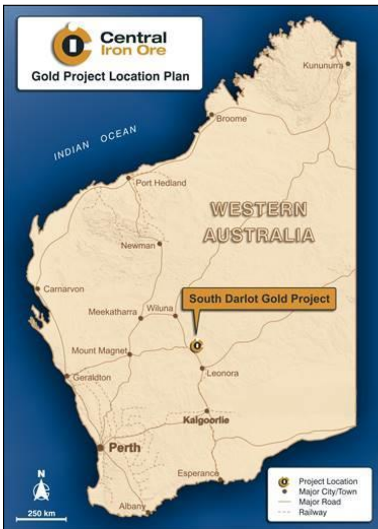
Figure 1: Locality map of the South Darlot project